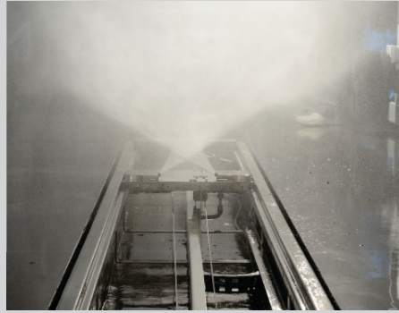
High operating pressure of 55 bar for effective cleaning