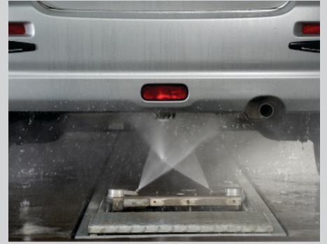
Rotating dual nozzle for better reach