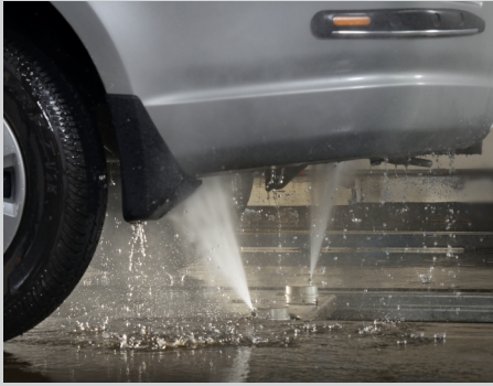
Low water consumption 24 litres per car