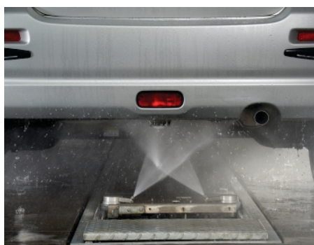
with Optional integrated UNDER CHASSIS WASHER